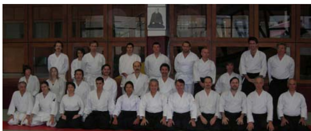
Stage International de Week End à Sète - Décembre 2008 Organisé par l'Aikido Takemusu Aiki France

Never giving in to the sirens of advertising and profit, his art spread outside of Sweden, and a lot of dojos follow his teaching in France, Italy, Portugal, Finland, England and Russia, free from the constraints of official federations.